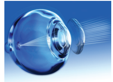
Superior aspheric optical design corrects aberrations for greater clarity across the power range.